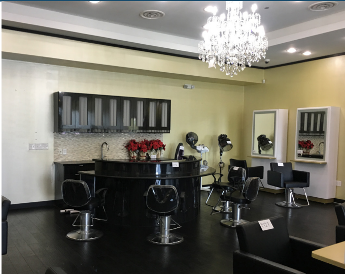
Space Available - 2,150 SF